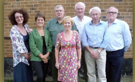
Our Team based in the UK