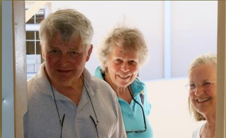
Our Team based in the USA

Masicorp would not be able to carry out any of its work in Masiphumelele (South Africa) without the generous help and support of our 60+ volunteers. Neither would we be able to run our organisation without the extensive fund raising efforts in both the USA and UK, and the time the respective overseas boards willingly give to our organisation. Likewise with our board members in South Africa.