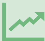
Maths test scores